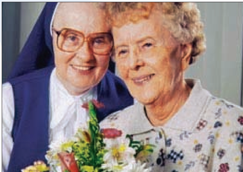
CHRISTUS Health is committed to delivering high quality, compassionate healthcare throughout its 350 medical facilities in the United States and Mexico.