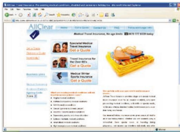
You can create award-winning Web sites with LANSA for the Web.

You will dramatically reduce the time it takes your organization to deliver eBusiness applications and stay ahead of your competition.